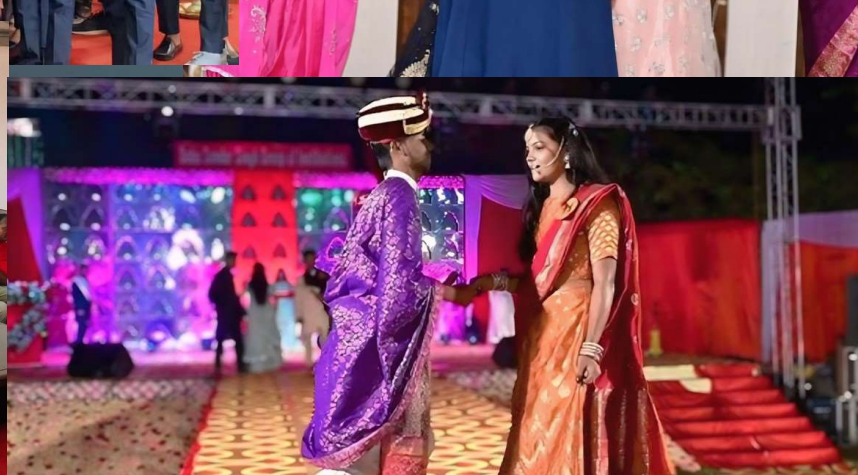
Techfest@2025, Matrabhoomi ki Pukar, Social Outreach (Cyber Security Awareness)