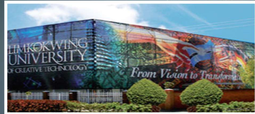
Limkokwing University of Creative Technology