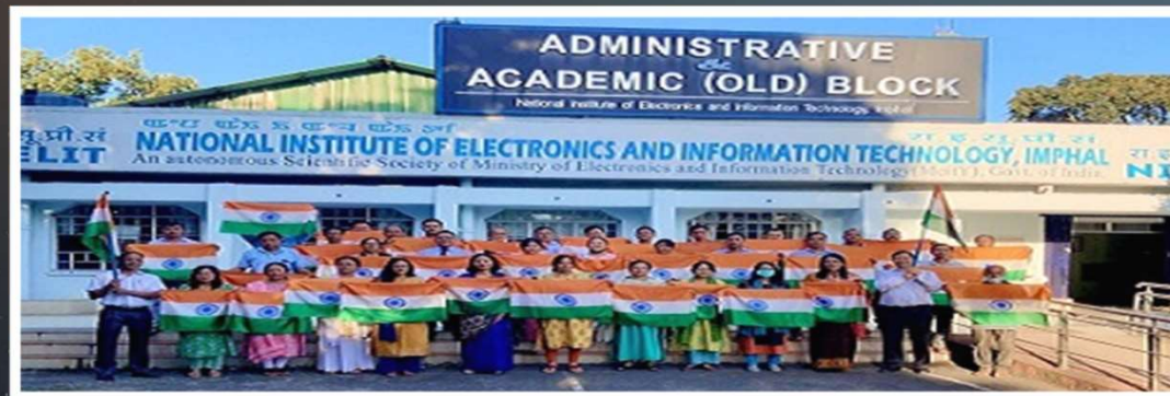
National Institute of Electronics and Information Technology